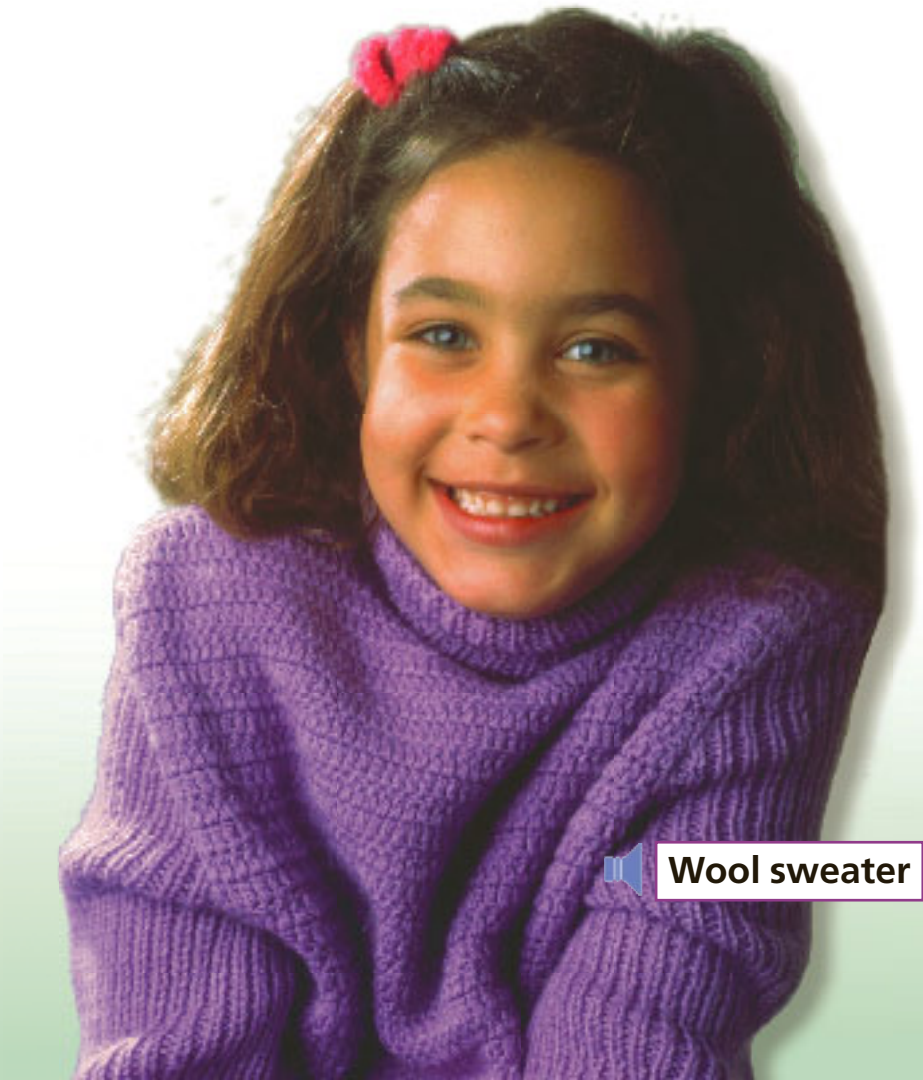
▶ Wool sweater