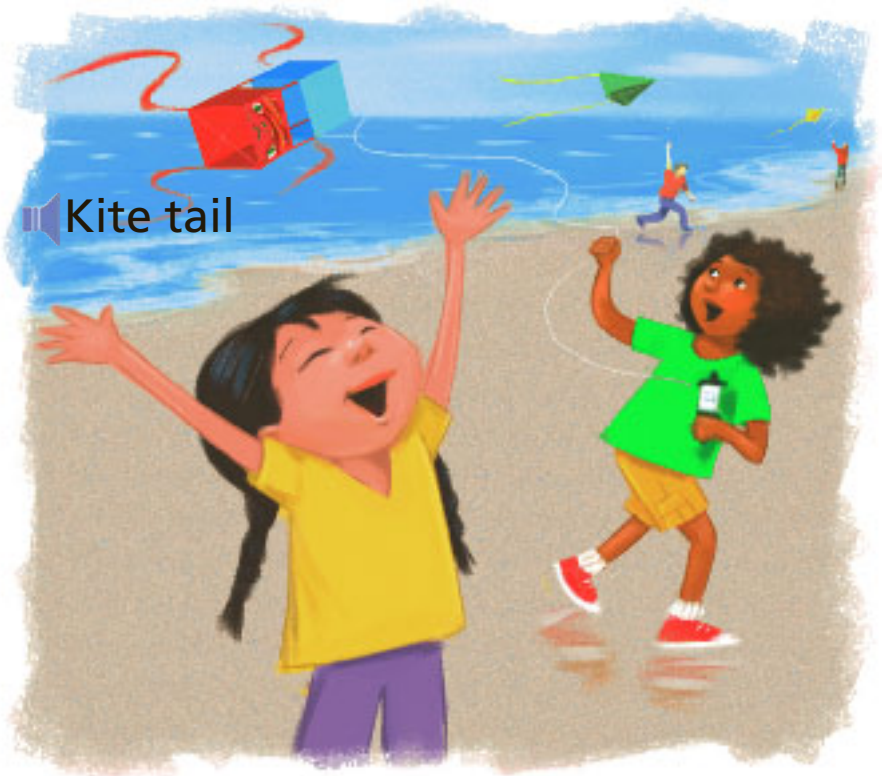
▶ Kite tail