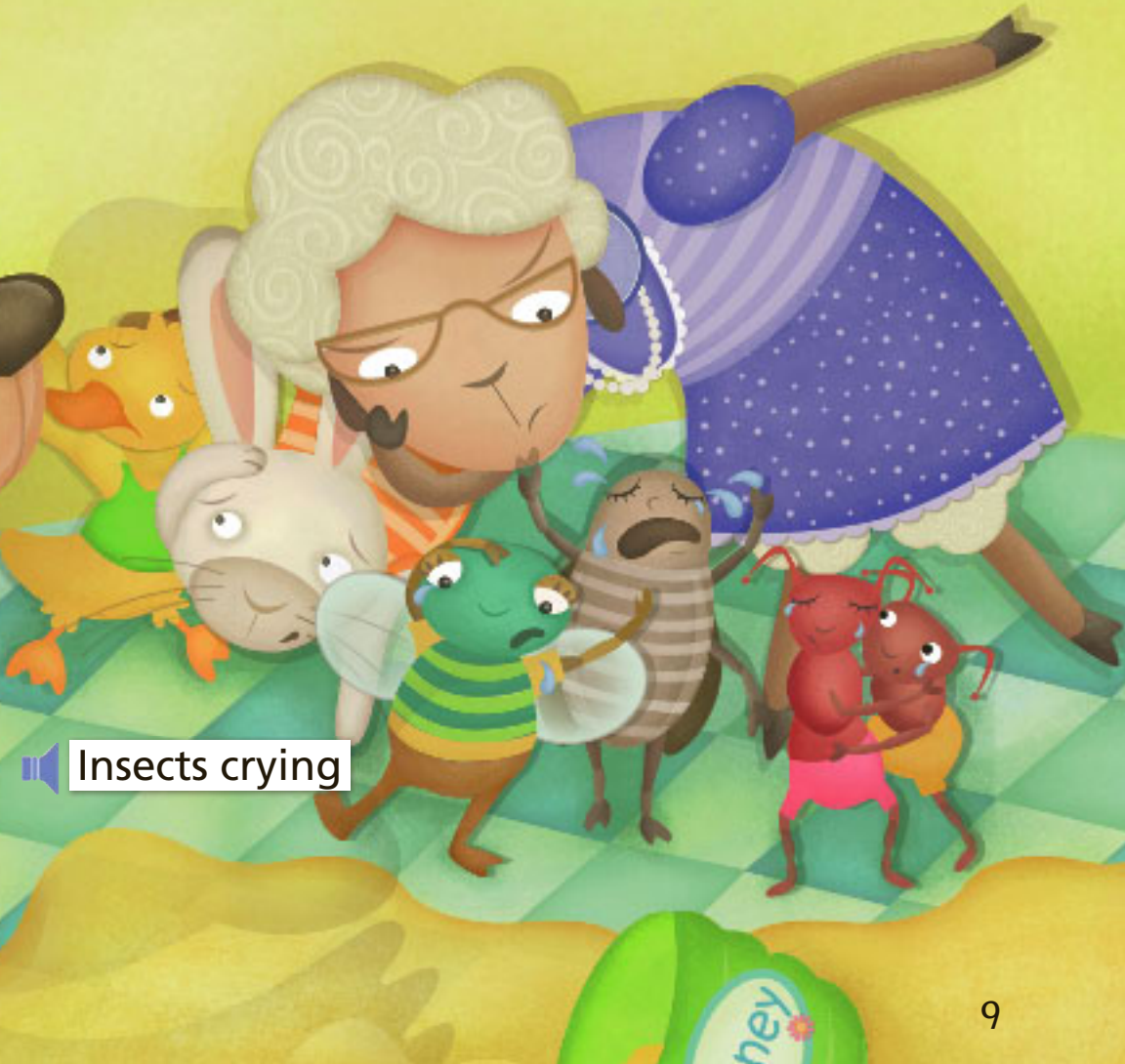
▶ Insects crying