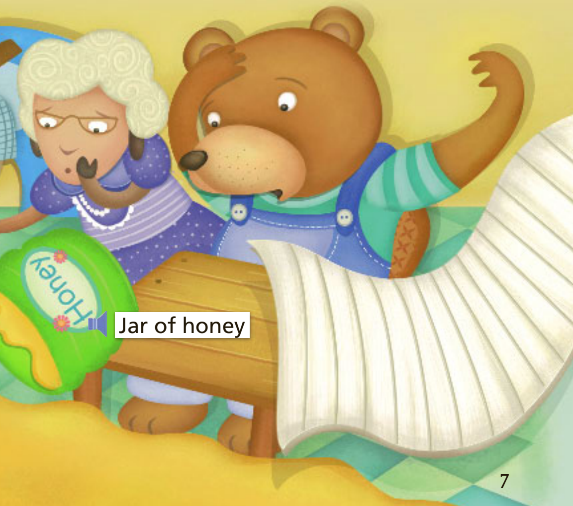
▶ Jar of honey