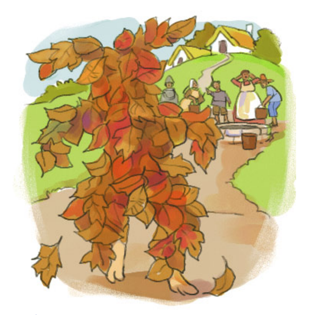
Then Uncle Rabbit set off for the water hole. His honey bath and leaf rolling made him look like a moving pile of leaves. No one had ever seen a creature like this before. And no one dared come near him.